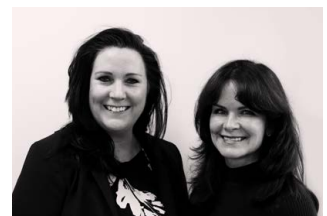
Promoting recovery and improved quality of life for severe and enduring eating disorder service users